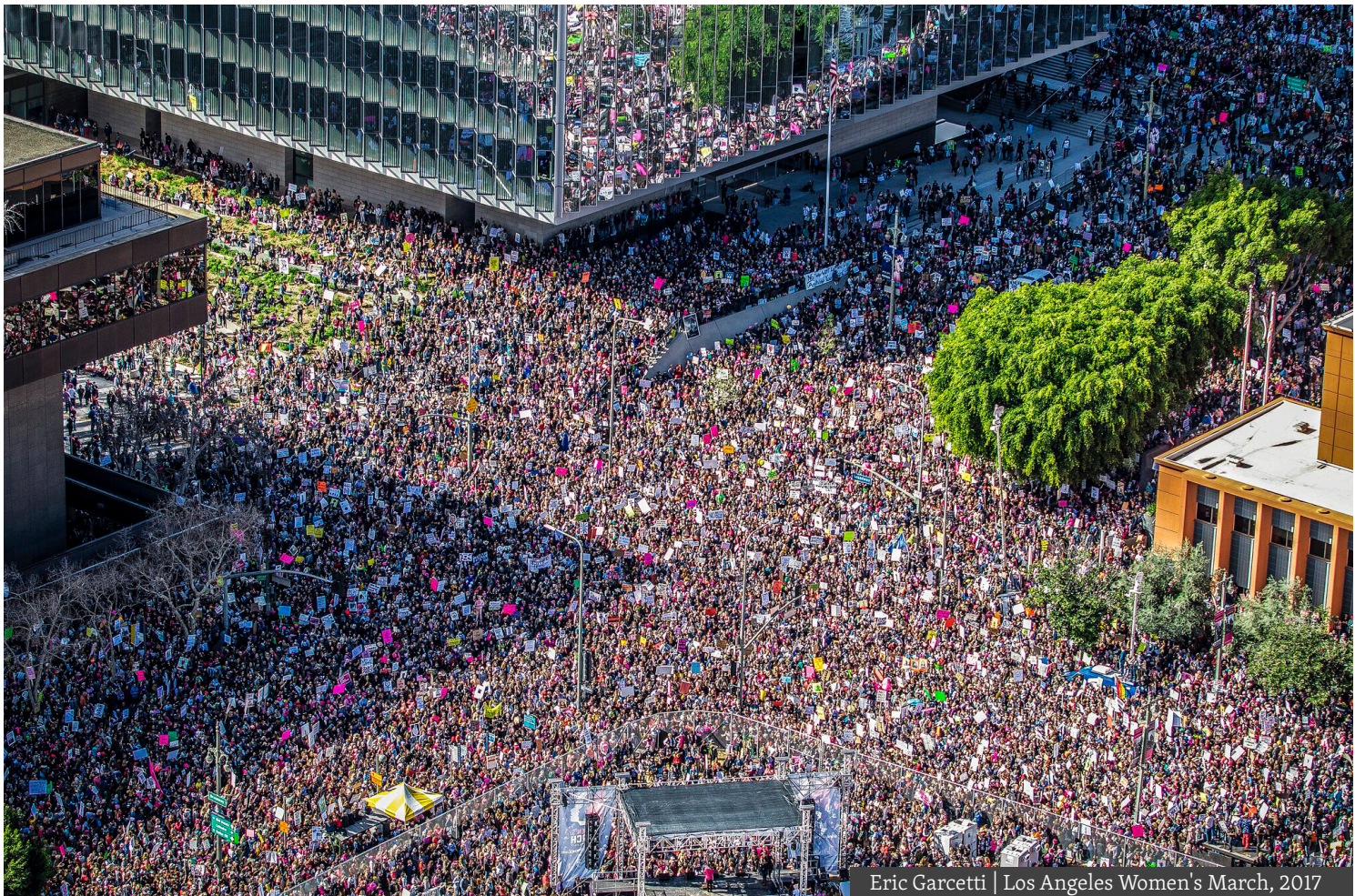
Eric Garcetti | Los Angeles Women's March, 2017

The largest single-day demonstration in U.S. history was the Women's March in January 2017. The event drew over 4 million people—between 1 and 1.6% of the U.S. population, into active participation across hundreds of locations.