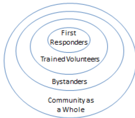
Figure A-2: Boston Strong: Communities of Resilience

Note: As indicated by the ellipses in the circles above, this figure is suggestive and is by no means intended to offer an exhaustive or all-encompassing representation of the many factors that make Boston Strong.