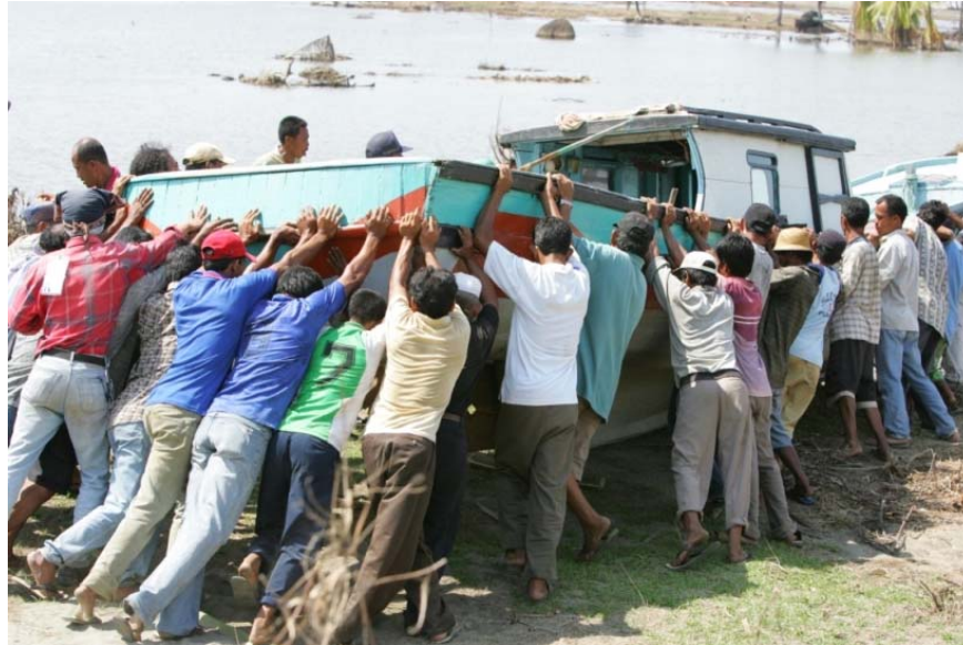
Community boat recovery near Meulaboh, Aceh, February 2005

to understand the implications of the local details that will affect results and may therefore be in a better position to choose which actions are most likely to succeed. If that is so, then providing those local agents with more authority and more resources with which they can choose and then act may be a better approach than trying to carry out (or impose) centralized decision-making and planning.