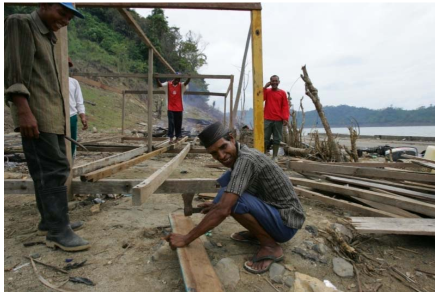
Fishermen in Layueng building their bunkhouse, January 2005

The main feature of the centralized action approach could be characterized as “intelligent design.” The basic idea is that experts can survey the situation, understand its contours and the needs within it, create coherent and comprehensive plans to address those needs, mobilize the relevant resources, and direct the efficient execution of the planned programs. Omniscience – or, at least, superior perspective, grasp, and capacity – is an implicit underlying assumption of this approach. It imagines that a high performance in aiding the afflicted can be constructed through an intelligently operated design and execution process. It sees high performance as something that can be directly produced, something an organization can be driven to create.