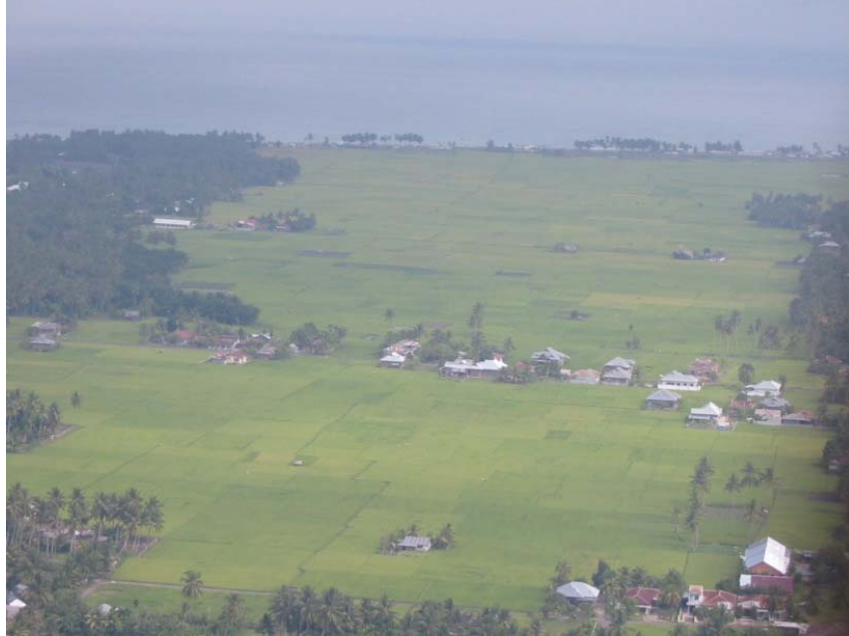
Photo taken from helicopter in Tsunami zone in Northern Aceh, February 2005

destruction, along the narrow strip of devastated coastline. Turning 90 degrees – facing away from the ocean, looking at what was generally left unphotographed immediately behind the camera, one often sees the social infrastructure from which the true recovery will inevitably actually be built.