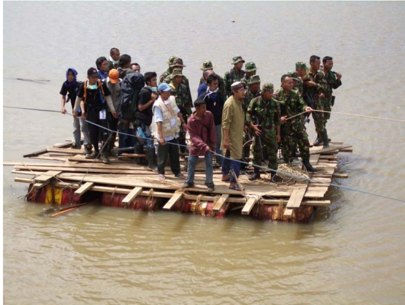
Improvised river crossing near Banda Aceh, January 2005

The task of relief agencies then becomes the task of supporting intelligent and motivated action at the village level. If agencies quickly provide the conditions (resources and decision-making powers) to the people of Layeung; a fishing village and economy will soon emerge. By contrast, a planned fishing economy that would be designed, constructed, and imposed from above is much less likely to succeed. The form of the recovery will be unpredictable because the knowledge and choices are imbedded within the people. But life itself is an emergent phenomenon. Regardless of what we attempt to plan, emergence will happen.