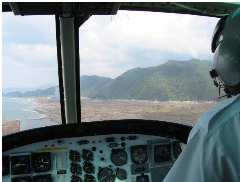
Photo taken from USAID helicopter in Aceh, February 2005

But there is another sense in which these observations were highly misleading . From a wider angle view – from a higher altitude than most helicopters will fly – one is struck not so much by how much was destroyed, but instead by what a small fraction of the area was actually affected. The peculiar nature of a tsunami is that it is exclusively a shoreline phenomenon. It has an edge – often a very sharp edge. On one side of the street, utter destruction – buildings leveled, all useful man-made objects swept completely away. On the other side of the street, completely untouched houses, businesses, a still-functioning and capable community, with deep reserves both physical and emotional, and a substantial accumulation of social and human capital – relationships and knowledge on which communities and livelihoods are built ... and with the help of which neighboring devastated areas can be rebuilt.