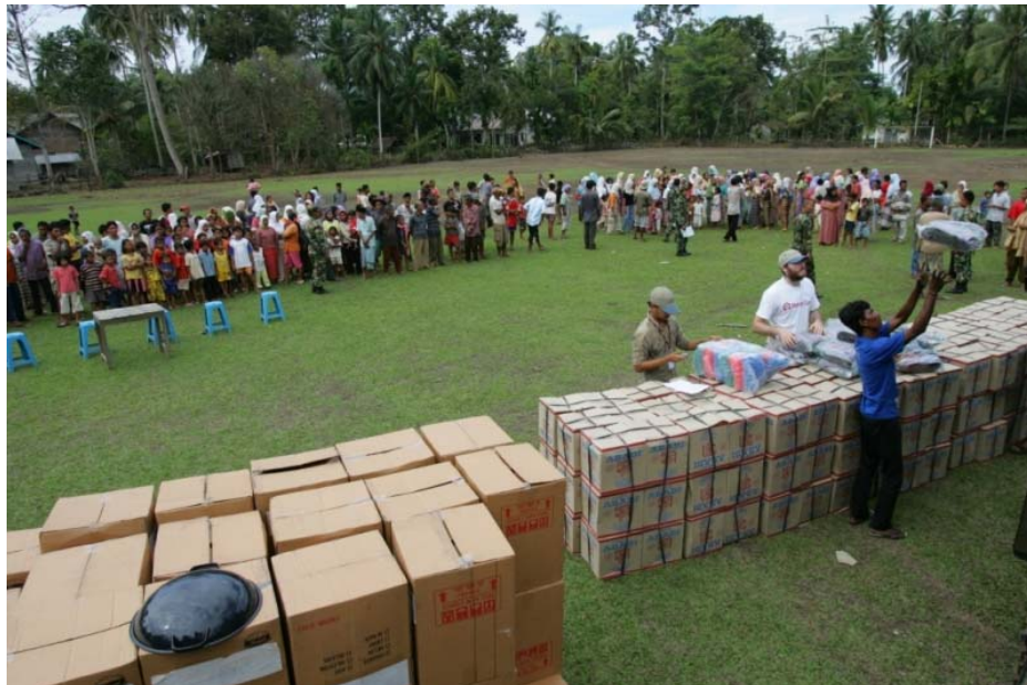
General Distribution in Meulaboh, Aceh, January 2005

And so organize they did. Agencies – the UN, international NGOs, elements of US and British and other military forces, and dozens of others – descended on the regions of impact. Planeloads of people and supplies materialized. Headquarters were established, supply depots built, fleets of vehicles brought in or assembled to enable local distribution of relief commodities. In the face of an obvious and well-defined need, an organized, commensurate response – experienced, expert people with only a desire to help, providing resources to sustain life and health in the short run, and to provide opportunities for rebuilding over the longer run – arose and began designing and implementing itself.