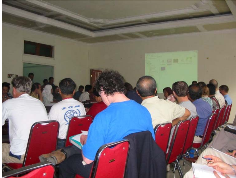
Photo taken during Aceh Central Planning Meeting, February 2005

combined situation across affected areas, and have available to them routines and processes and the associated resources (skilled people, equipment, supplies) that are called for – that is, where their expertise and reserves of and access to resources are well tuned to the true circumstances on the ground – centrally-organized and directed action can be efficient, effective, and highly productive.