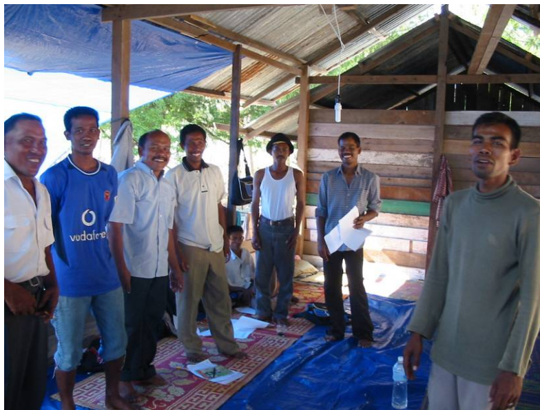
Village meeting following cash disbursement for recovery, February 2005

The results of a strategy of emergence are, by definition, difficult to predict. Both emergence and central planning have risks – but they have different risks. Some local choices will be ill-advised, and will not work out well. A tolerance for some failures is essential. But there has rarely been a better opportunity. The Acehnese people are motivated, industrious and resourceful. On the world scale of development, Aceh is a proud, capable and functioning society. It will fully emerge again. Life itself is emergence. The rest is just talk and reports.