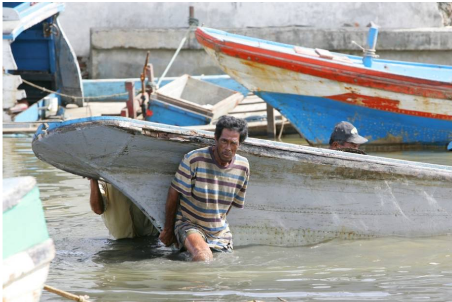
Community boat recovery in Meulaboh, Aceh, January 2005

If we are able to depart from the centrally planned approach, the challenge is then to figure out how to properly support emergence. Irresponsibly spreading cash around the countryside would hardly be an effective component of such a strategy. But if a number of reputable agencies were to work together to select representative villages and test a variety of cash distribution methods, progress on figuring out which methods seem to work best could be rapid. Alternative cash distribution schemes include community grants, grants to individual households, targeted supports to key industries, grants to cooperatives, village endowments, and revolving loan programs – all of which might be tried, in different locations, to see which seem best able to support the emergent reconstruction of lives, livelihoods, and communities.