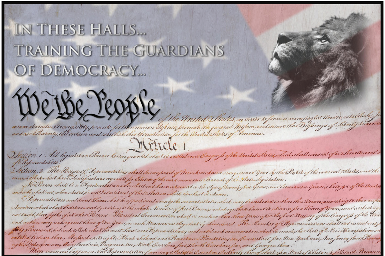
Figure 2. A 6' x 9' Mural of the United States Constitution